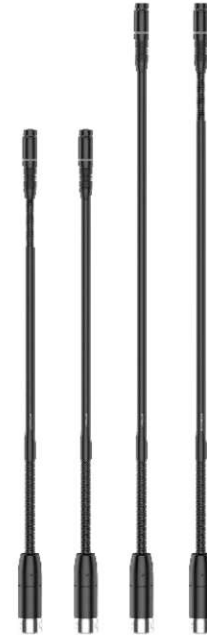
MXC Gooseneck Microphones