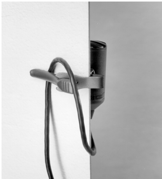
CABLE ANCHORING FIGURE 4

Insert the SM11 in the tie clasp and anchor the cable as shown in Figure 4. Affix the clasp to a tie, shirt, or blouse. Note that the microphone can be swiveled 360° in its holder for left, right, or vertical ("pen clip") use.